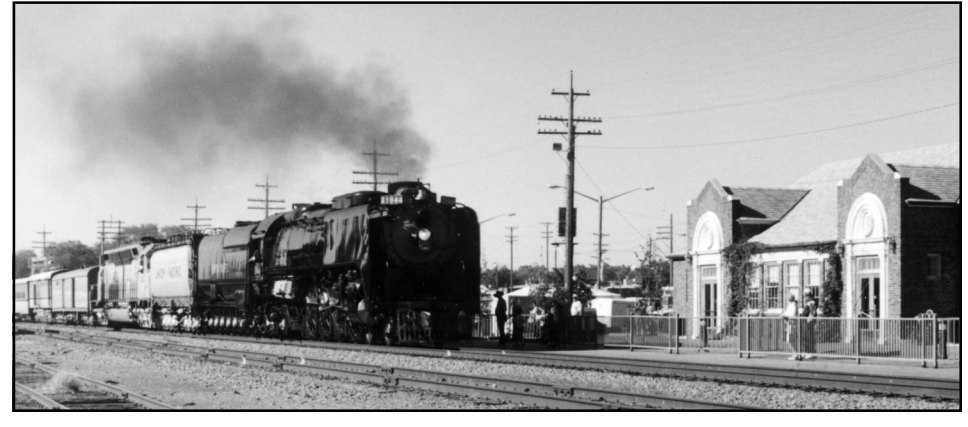
Union Pacific 844 pulls last year's Cheyenne Frontier Days Train past the Greeley, Colorado depot on July 19. 1998.

The first Post train to Cheyenne in 1908