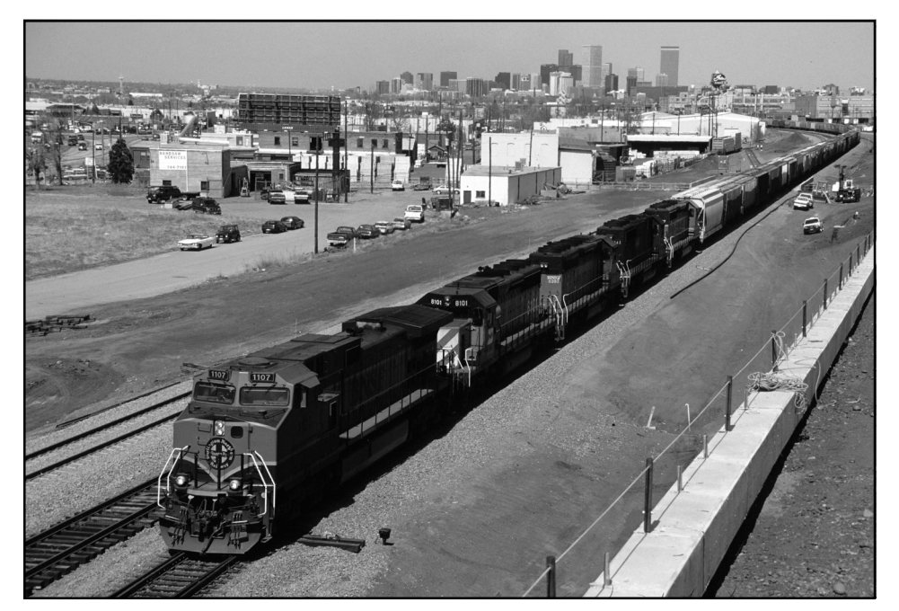
BNSF grain load G-MCNPLX1-21 (McCook, NE, to Palestine, TX) operated south on the old northward main, now known as Main 2. BNSF 9-44CW #1107 lead the five units. Note the middle siding, left of BNSF 1107 South, was still under construction on March 23, 1999.

Union Pacific moved the car from its long term storage near I-70 and South Havana on April 8th. That evening, CEDAR RAPIDS and two Rocky Mountaineer Railtours passenger cars were interchanged to BNSF 31st Street Yard.