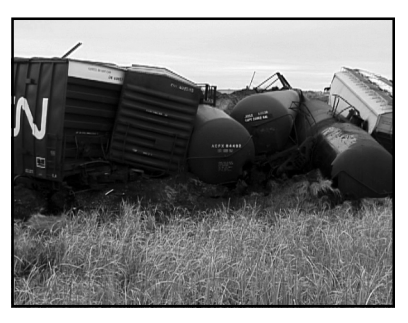
West end of derailment. CN boxcars' coupler is broken off.