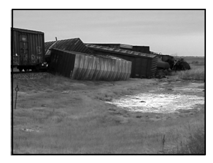
The north side of BNSF's east-west line between Denver and Chicago. No HAZMAT involved. Only sugar water and molasses may have leaked.

Photos of the April 1st derailment that occurred between Hudson and Keensburg, CO, were posted on the Rocky Mountain Railroad Club website about 15 hours after the derailment occurred. The quick posting demonstrated the ability of the Internet to provide information quickly. The club website is at www.rockymtnrrclub.org.